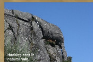
Hacking nest in natural hole