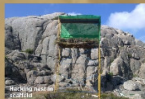
Hacking nest in scaffold