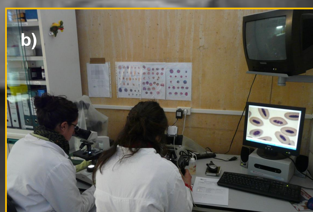
a) Blood sample collection in a Black vulture ( Aegypius monachus ) b) GREFA's hematology laboratory